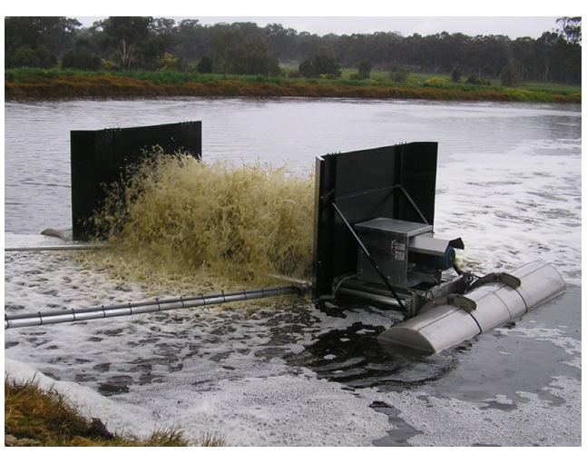
Floating Brush Aerator shown with standard splash shields